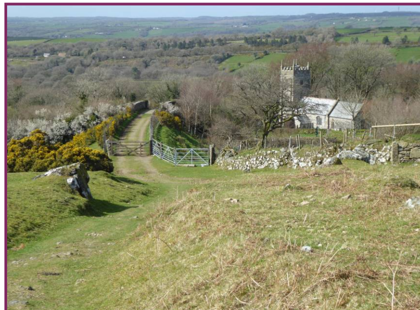
The church of St Thomas à Becket, Sourton

The path soon curves left along the contours; the wall drops away to the right. Keep on the main path, ignoring any crossing paths, across the lower slopes of the Sourton Tors. When level with the first of the outcrops on the ridge, at a broad and obvious path junction, bear right, downhill, to reach and walk parallel to a wall. Where the wall drops away sharply bear right, descending Sourton church of St Thomas à Becket. Pass through a gate and cross the Granite Way (the poor visibility option joins from the right). Head down past the church and the village hall. Bear left across the green, passing the parish noticeboard, to reach the main road (A386) in Sourton.