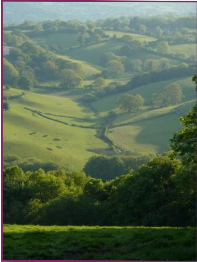
The landscape near Moretonhampstead

Turn left, and through another gate. Keep along the left edge of the next field - Moretonhampstead, nestled beneath Mardon Down, comes into view - at the end crossing a stile onto a lane. Turn right; within a few yards turn left down a hedged track, which leads via a gate into a field. Head down the left edge of two fields, bearing right at the bottom to cross a stile. Head straight across the next field and through a gate. In the next field parallel the left hedge; cross a small stile by a footpath sign onto a track, to the right of farm buildings.