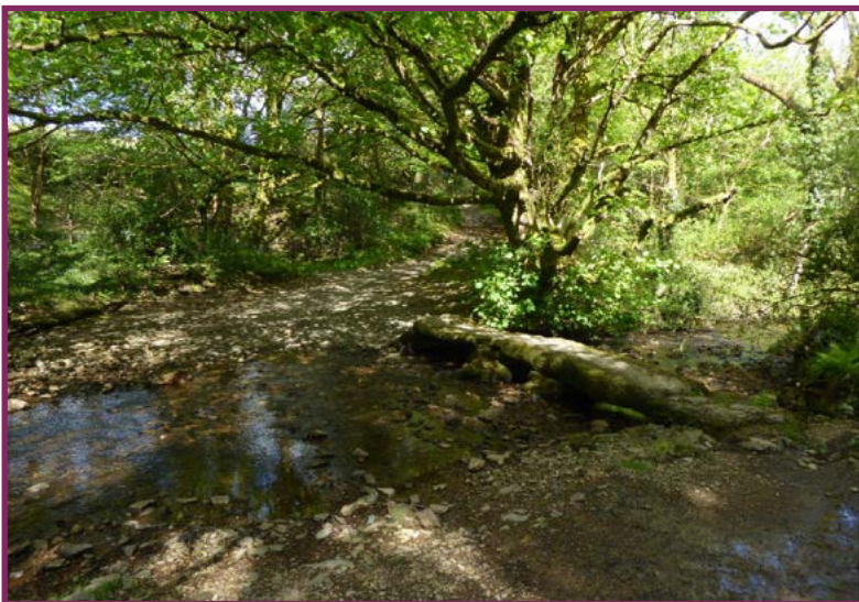
Clapper Bridge near Cross Furzes

Follow the obvious path across the grassy sward, eventually descending gently and passing through a gate. Head downhill through a plantation, then go through a gate by enormous beech trees to meet a path junction. Keep straight on through another gate to cross the Dean Burn on a granite clapper bridge. The track ahead ascends to a lane junction.