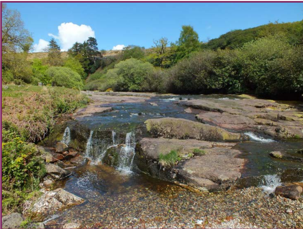
The River Avon above Shipley Bridge

S This stage starts at the entrance to the car park at Shipley Bridge. Facing the car park turn right along the lane.