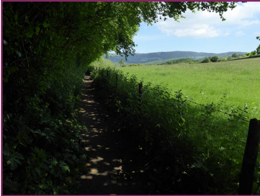
Footpath from Holne to New Bridge

5 Turn left on a lane to Hannaford, passing the car park and toilets (the Two Moors Way ducks down sharp left to pass under the bridge). Look out for a metal barrier and bear left on a broad path into the DWT's Dart Valley Nature Reserve. This lovely path, walled in places, leads through the woods; at a path junction, with a five-bar gate right (Lower Hannaford Farm), keep straight on, soon entering more open ground with bracken and scattered hawthorns.