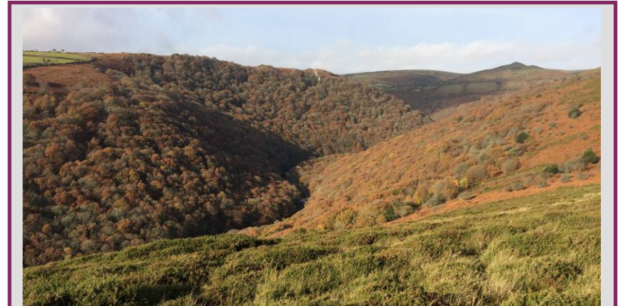
On Dr Blackall's Drive

to stop for a breather and look back at the view!) and continue the climb, emerging from the bracken and passing through low-growing gorse and heather. At long last the track - Dr Blackall's Drive, a nineteenth-century carriage drive - is reached.