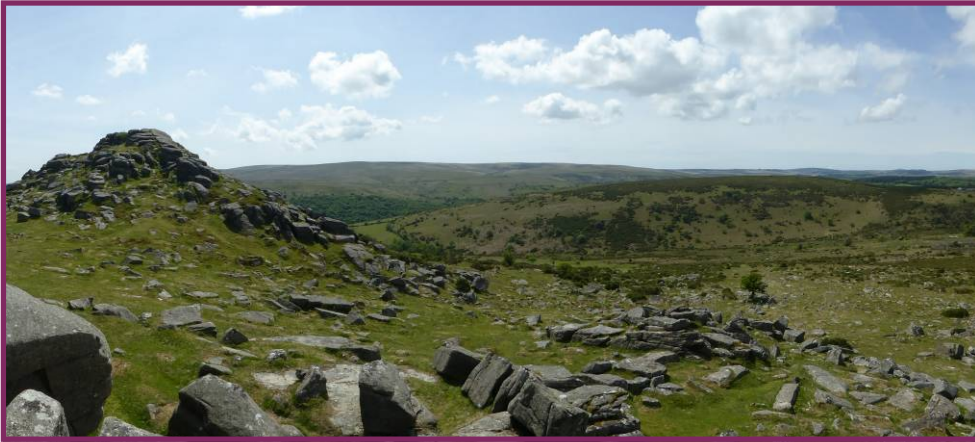
On Sharp Tor

8 Where the wall on the left drops away bear right and head up towards Sharp Tor on a broad grassy way, aiming for the saddle between the two main outcrops. Cross the saddle: your next port of call is the parking area that can be seen on the road on the other side of the flat-bottomed combe ahead. Two paths wend their way up the far side - you need to find your way to the one on the right.